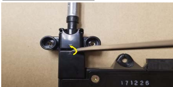
Use a flat screw driver to open the cover.