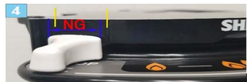
If not centered correctly, there may be issues while trying to ignite the flame