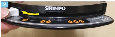
Slide the control lever all the way to Stop position

Slide the lever 2x as shown on the left and compare where the lever rests. Reference the diagram to the right.