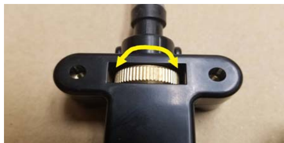
Correctly adjust the lever's position by turning the gold knob. Reference the diagram above for correct positioning. Close the cover after checking.