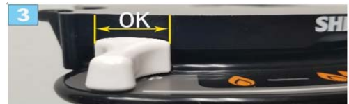
The lever has to be centered in this position