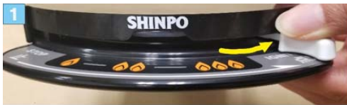
Slide the control lever all the way to Ignition position